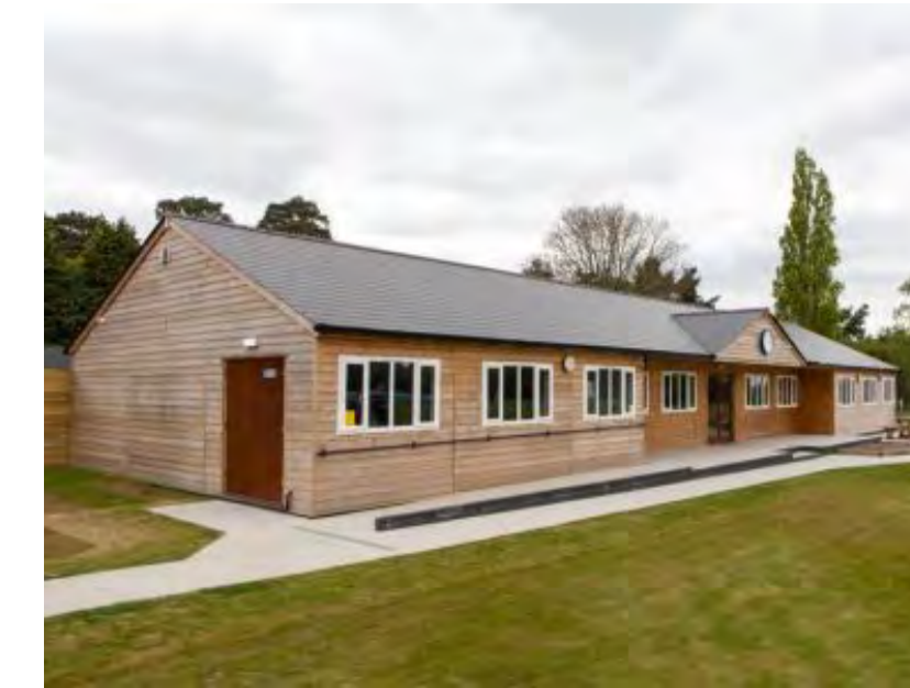
101/03: EXAMPLE PAVILION scale: NTS