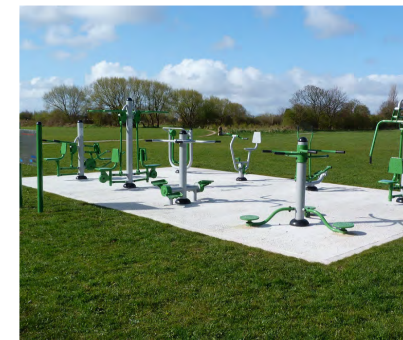
101/05: EXAMPLE GYM EQUIPMENT scale: NTS