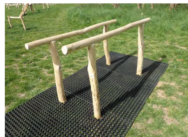
101/02: EXAMPLE TRIM TRAIL EQUIPMENT scale: NTS