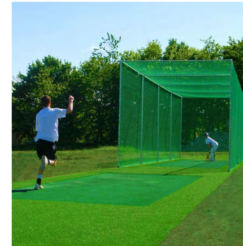
101/04: EXAMPLE CRICKET NET scale: NTS