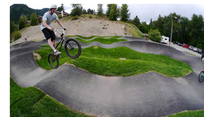
101/06: EXAMPLE BMX PUMP TRACK scale: NTS