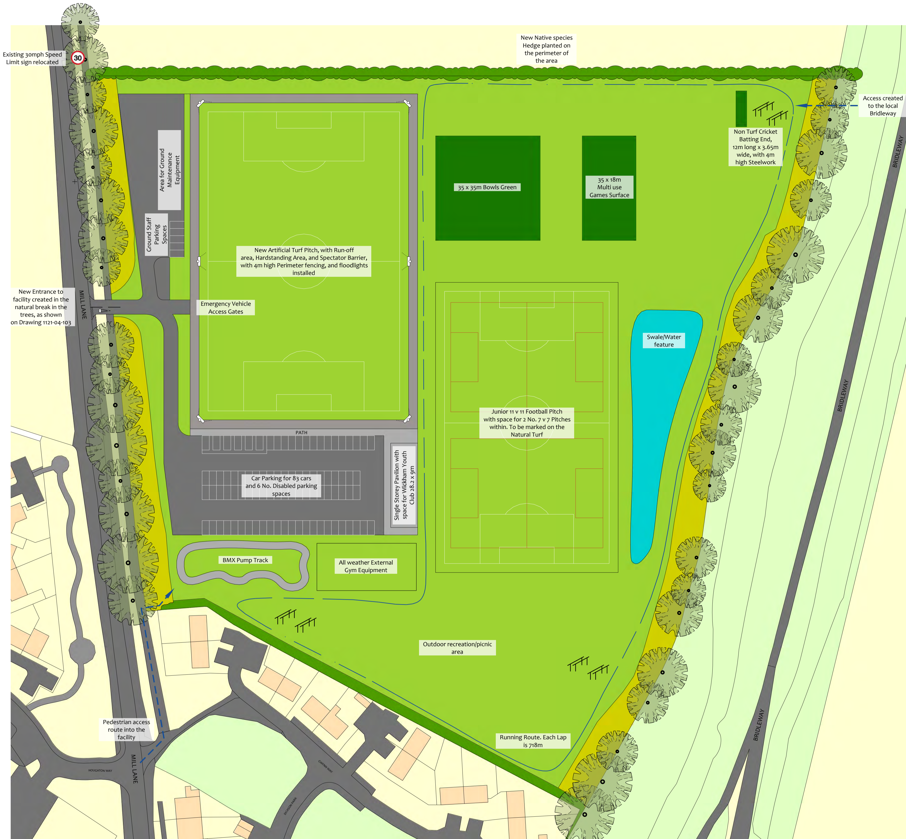
101/01: PROPOSED LAYOUT scale: NTS