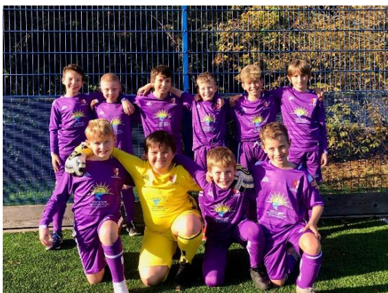
New kit sponsored by Wickham Parish Council and Wickham Dynamos FC

Hampshire Home Start £2,600 Poppy Appeal £35 Winchester and District Citizens Advice Bureau £2,000 Wickham Primary School sports kit £400 Knowle Post £2,000