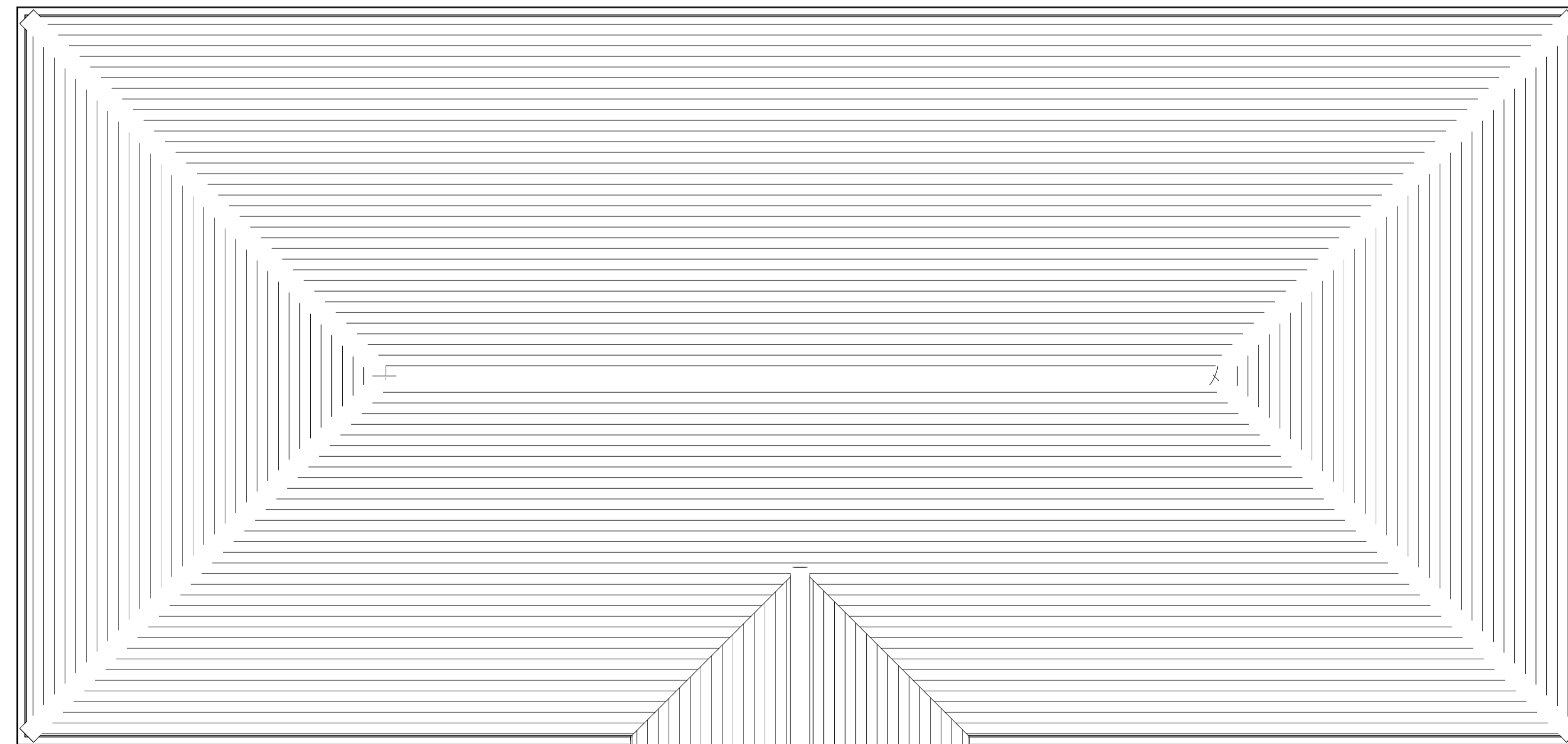
Roof Plan as Proposed 1 : 50